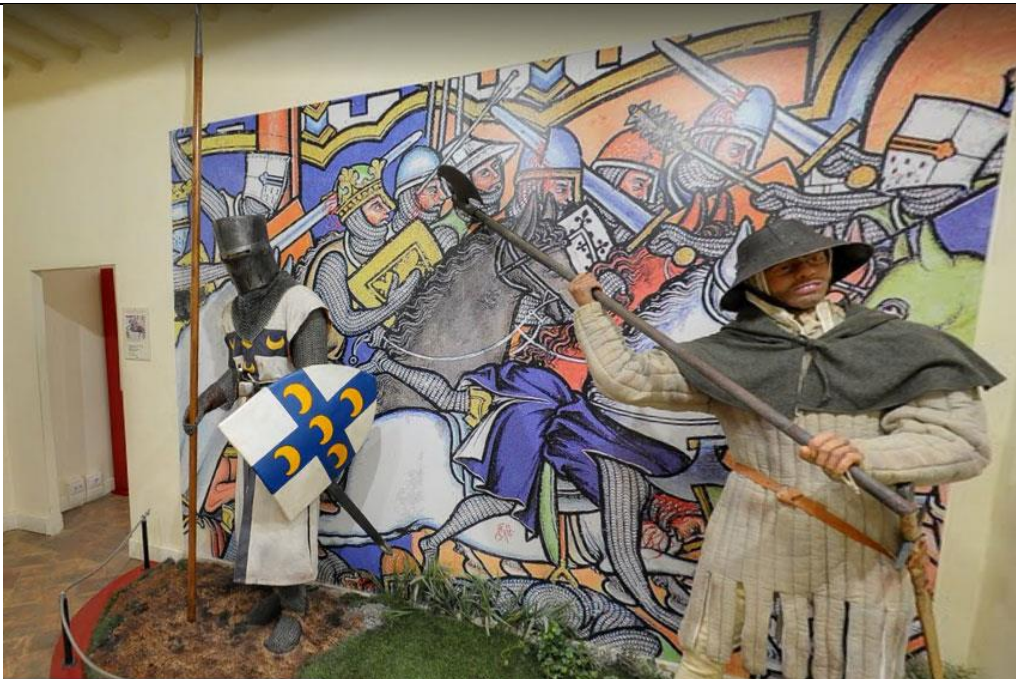
Monteriggioni – Medieval historic museum