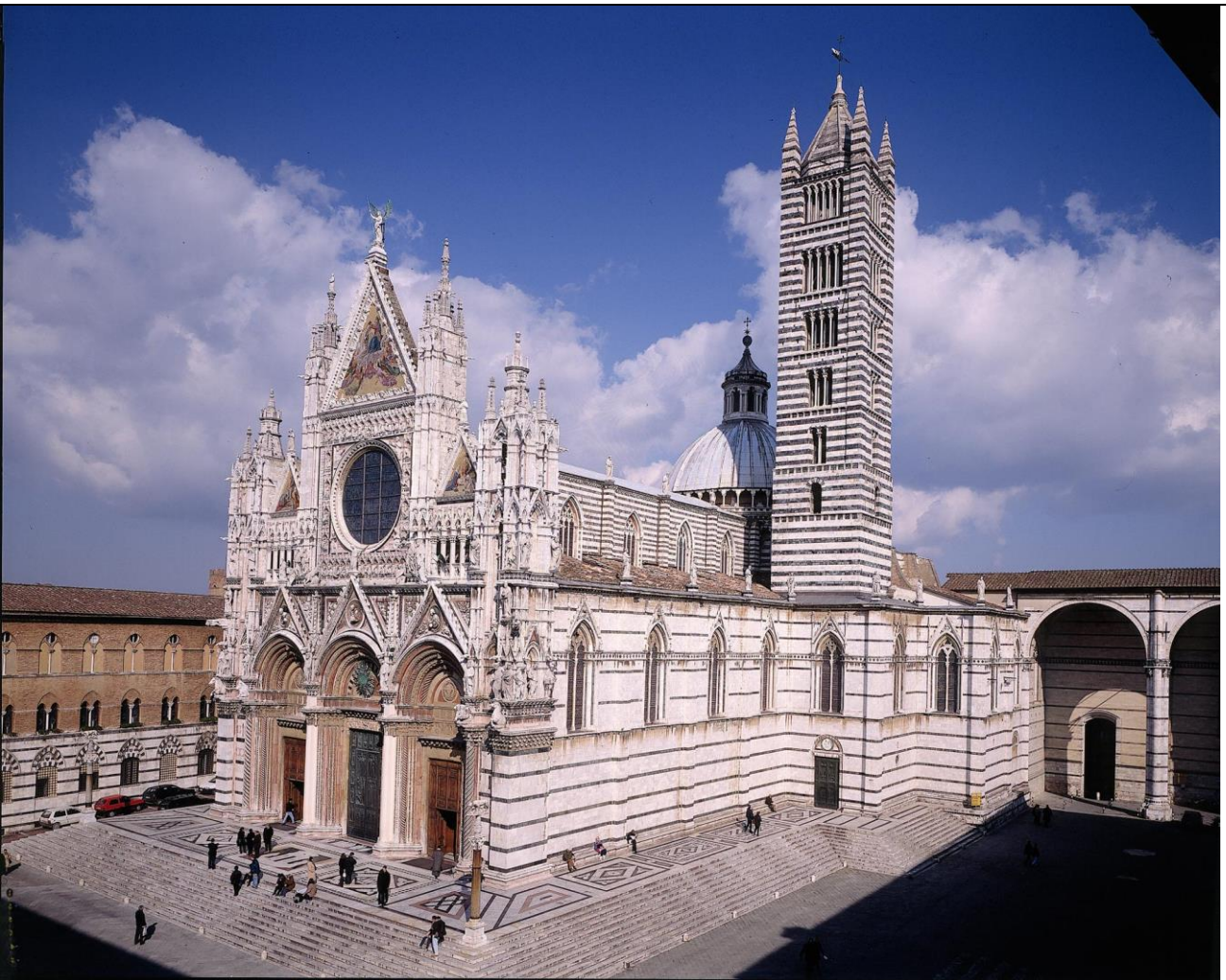
Siena – Piazza Duomo = Cathedral