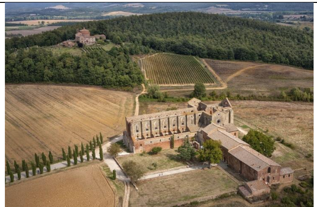
Abbazia di San Galgano – Medieval Abbey without roof (year 1288)