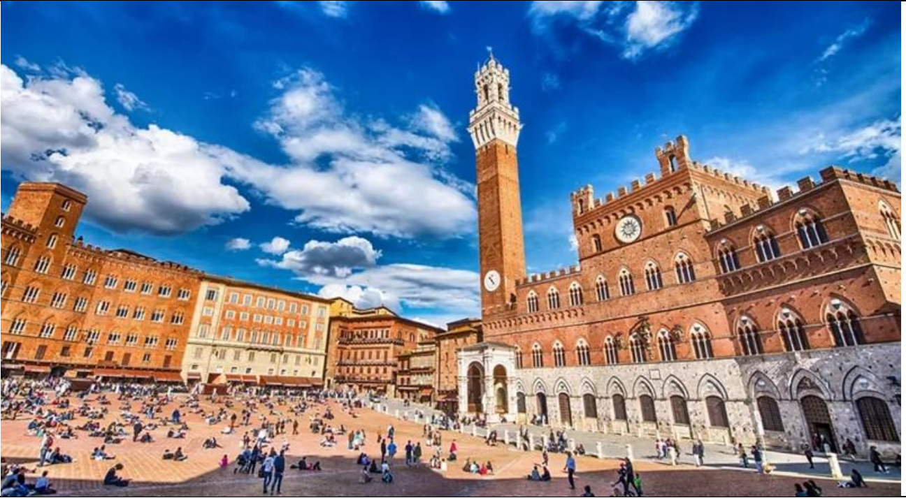
Siena – Piazza del Campo