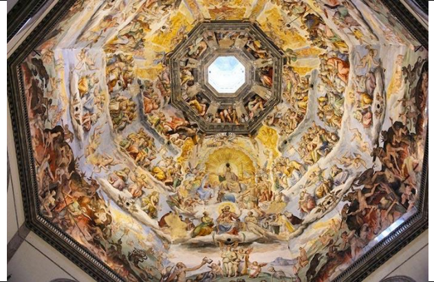
Firenze – Piazza del Duomo – Cattedrale di Santa Maria del Fiore