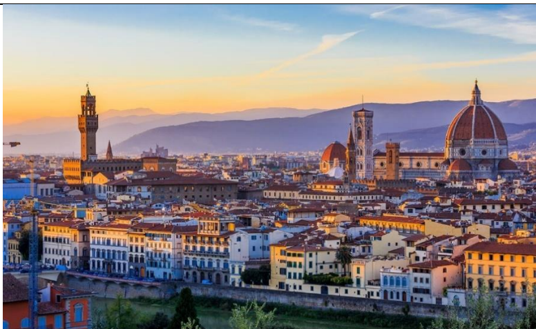
Firenze – Piazzale Michelangelo – Belvedere = Sightseeing