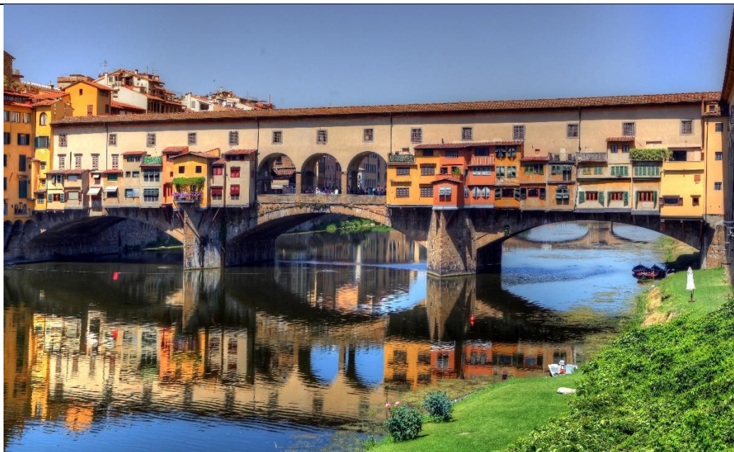
Firenze – Ponte Vecchio with traditional shops over river Arno