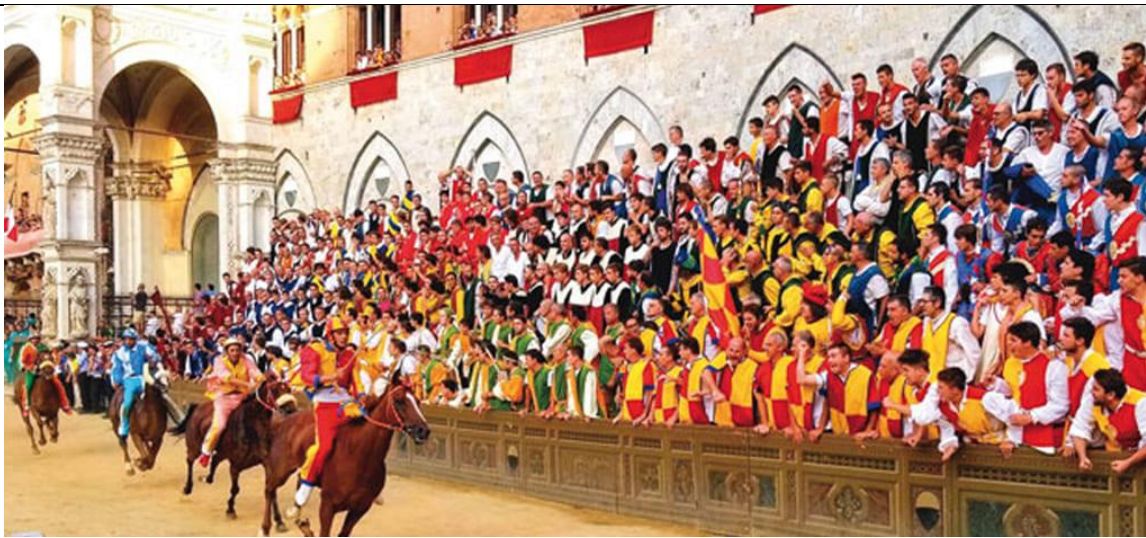
Siena – il Palio = famous historic horse race since middle age in Piazza del Campo, twice a year: July and August