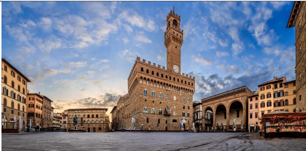
Firenze – Piazza Signoria with Palazzo Vecchio