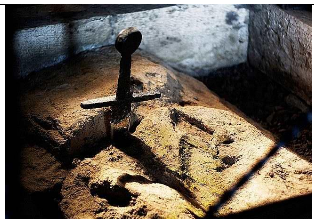
Rotonda di Montesiepi con la Spada nella Rocca (Sword in the Rock) (year 1182) up the hill, distance 200 m. from Abbey